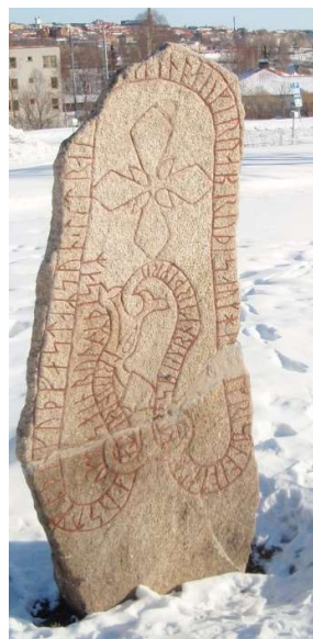
The Frösö Runestone from the mid-11th century. In the legend from 1635, Storsjöödjuret is said to be the serpent depicted on the stone.