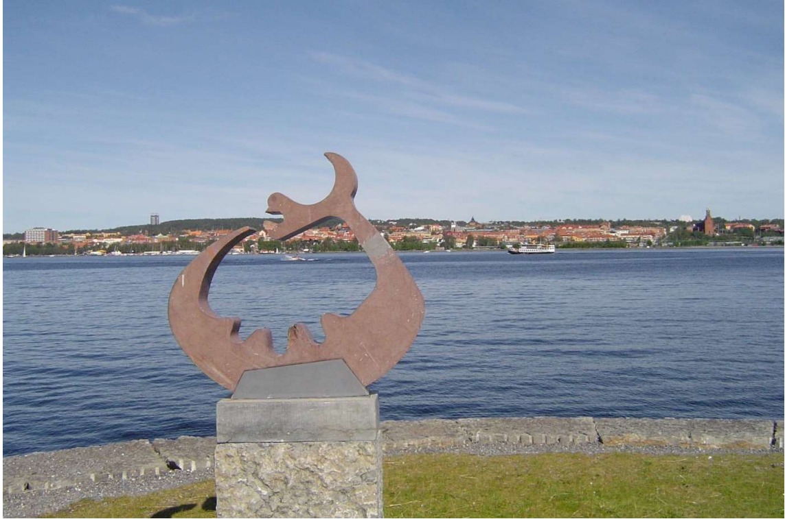
Storsjöödjuret and Östersund.