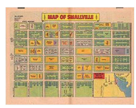
A map of the layout of the Silver Age version of Smallville. From The New Adventures of Superboy #22, October 1981.

Smallville's location varied widely throughout many stories, many of which placed Smallville close to Metropolis and Midvale, home of Supergirl. [20] All-New Collectors' Edition #C-55 (notable for featuring the wedding of Legion of Super-Heroes members Lightning Lad and Saturn Girl and published in 1978) calls Smallville "a quiet town, nestled in the hills just inland from the eastern seaboard." Most sources since the 1986 John Byrne Superman origin reboot point the location of Smallville to be in Kansas.