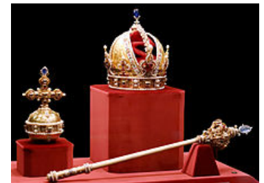
Crown, scepter and globus cruciger of Rudolf II.