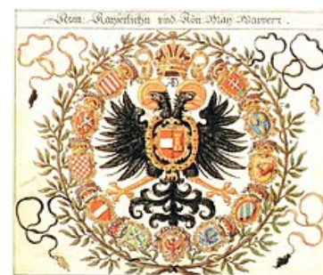
Great coat of arms, 1605