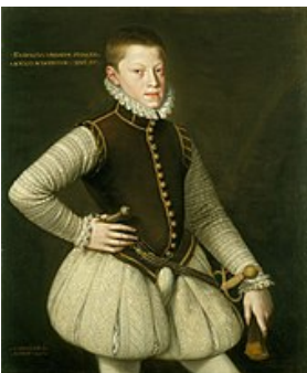
Archduke Rudolf, aged 15, painted by Alonso Sánchez Coello .

Rudolf was born in Vienna on 18 July 1552. He was the eldest son and successor of Maximilian II , Holy Roman Emperor, King of Bohemia , and King of Hungary and Croatia; his mother was the Spanish princess Maria , a daughter of Charles V and Isabella of Portugal . He was the elder brother of Matthias who was to succeed him as king of Bohemia and Holy Roman Emperor.