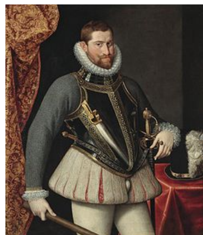
Portrait by Martino Rota .