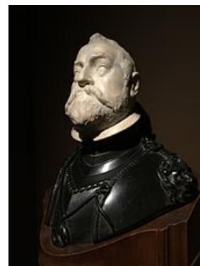
A portrait bust of Rudolf II in the collection of the Antwerp City Hall , Belgium

By 1604, his Hungarian subjects were exhausted by the war and revolted, led by Stephen Bocskai ( Bocskai uprising ). In 1605 Rudolf was forced by his other family members to cede control of Hungarian affairs to his younger brother Archduke Matthias . By 1606, Matthias had forged a difficult peace with the Hungarian rebels ( Peace of Vienna ) and the Turks ( Peace of Zsitvatorok ).