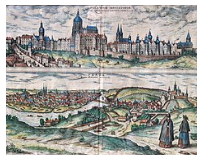
Prague Castle in 1595 by Joris Hoefnagel .