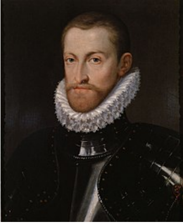
Portrait of Rudolf II as a young man by Martino Rota .

Rudolf was angry with his brother's concessions, which he saw as giving away too much in order to further Matthias' hold on power. So Rudolf prepared to start a new war with the Turks. But Matthias rallied support from the disaffected Hungarians and forced Rudolf to cede the crowns of Hungary, Austria, and Moravia to him. At the same time, Bohemian Protestants demanded greater religious liberty, which Rudolf granted in the Letter of Majesty in 1609. Bohemians continued to press for further freedoms, and Rudolf used his army to repress them.