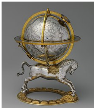
Richly ornamented celestial globe with clockwork, made for the Kunstkammer of Rudolf II, 1579

As was typical of the time, Rudolf II had a portrait painted in the studio of the renowned Alonso Sánchez Coello . Completed in 1567, the portrait depicted Rudolf II at the age of 15. This painting can be seen at the Lobkowitz Palace in the Rozmberk room.