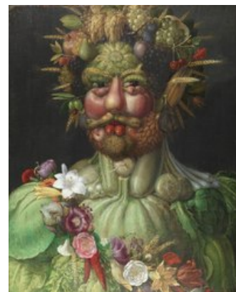
Rudolf painted as Vertumnus , Roman God of the seasons, by Giuseppe Arcimboldo (1590–91). Rudolf greatly appreciated the work.