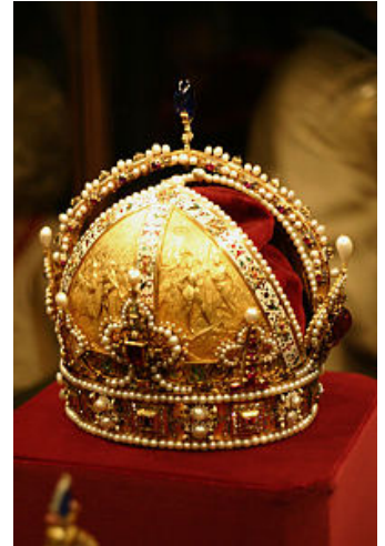
The Crown of Rudolf II later became the imperial crown of the Austrian Empire .

Rudolf was even alleged by one person to have owned the Voynich manuscript , a codex whose author and purpose, as well as the language and script and posited cipher remain unidentified to this day. According to hearsay passed on in a letter written by Johannes Marcus Marci in 1665, Rudolf was said to have acquired the manuscript at some unspecified time for 600 gold ducats . No evidence in support of this single piece of hearsay has ever been discovered. The Codex Gigas was also in his possessions.