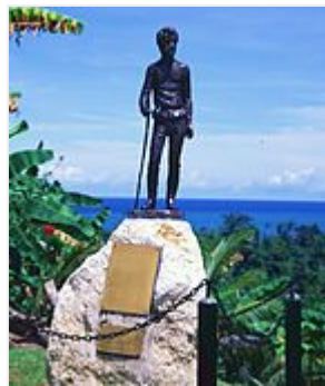
Monument to Miklouho- Maclay in New Guinea