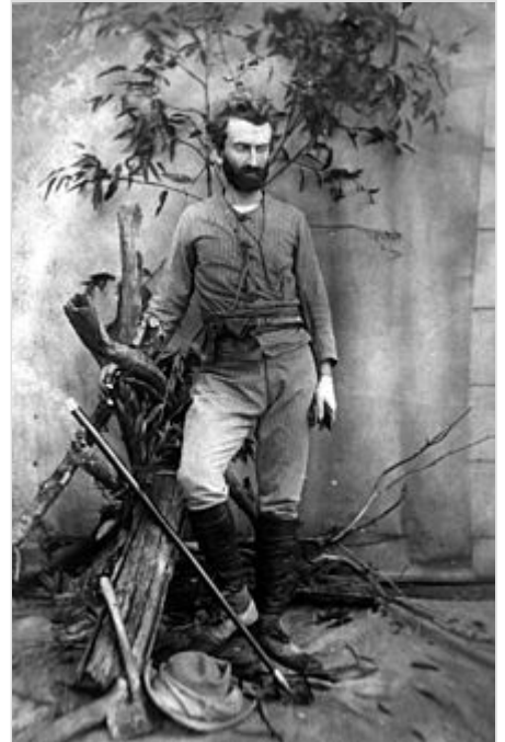
Miklouho-Maclay, ca. 1880 in Queensland, Australia. A typically posed shot from the period to emphasise the "explorer" persona — note the Eucalyptus leaves, and explorer "tools".

—Leo Tolstoy, to N. N. Miklouho-Maclay, September 1886 [16]