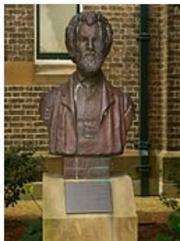
Bust of Miklouho-Maclay, Macleay Museum at University of Sydney