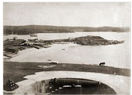
The Marine Biological Station (centre of photo) at Watson's Bay circa 1881.