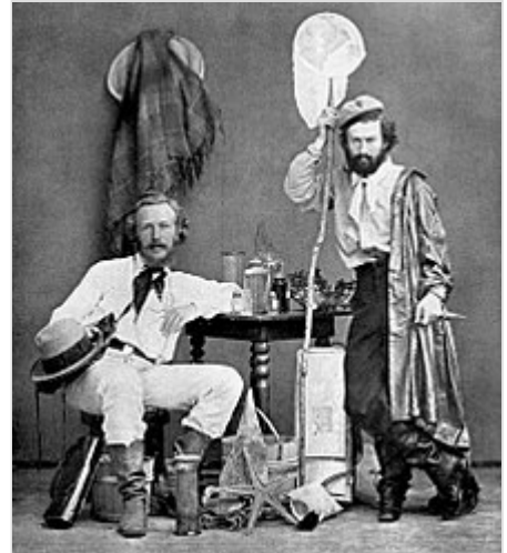
Ernst Haeckel with his assistant, Nicholai Miklouho-Maclay, in the Canary Islands, 1866

Some scientists, such as Ernst Haeckel, a teacher of the young Miklouho-Maclay, relegated what they regarded as culturally "backward" people like Papuans , Bushmen and others to the role of 'intermediate links' between Europeans and their animal ancestors. While adhering to Darwin's theory of evolution , Miklouho-Maclay diverged from these concepts, and it was this question that led him to gather scientific facts and to study the dark-skinned inhabitants of New Guinea. On the basis of his comparative anatomical research, Miklouho-Maclay was one of the first anthropologists to refute polygenism , the view that the different races of mankind belonged to different species . [4][15]