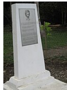
Monument near Bongu Village, Madang Province , New Guinea