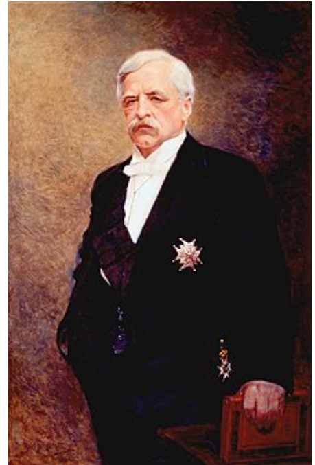
Nils Adolf Erik Nordenskiöld by Axel Jungstedt 1902

Nordenskiöld was born in 1832 in Helsinki , the capital of Finland, but he spent his early youth on the family estate in Mäntsälä . He went to school in Porvoo , a small town on the south coast of Finland. He then entered the Imperial Alexander University in Helsinki in 1849 where he studied mathematics , geology , and applied himself especially to chemistry and mineralogy . [1] He received his master's degree in 1853. Two years later he published his doctoral dissertation , entitled " Om grafitens och chondroitens kristallformer " ("On the crystal forms of graphite and chondrodite ").