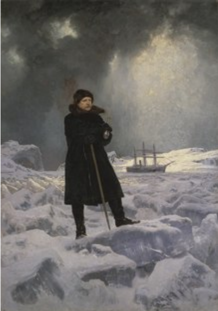
Nils Adolf Erik Nordenskiöld with the Vega Georg von Rosen (1886)

Nordenskiöld's participation in three geological expeditions to Spitsbergen, followed by longer Arctic explorations in 1867, 1870, 1872 and 1875, [3] led him to attempt the discovery of the long-sought Northeast Passage . This he accomplished in the voyage of the SS Vega , navigating for the first time the northern coasts of Europe and Asia. Starting from Karlskrona on 22 June 1878, the Vega doubled Cape Chelyuskin in the following August, and after being frozen in at the end of September near the Bering Strait , completed the voyage successfully in the following summer. He edited a monumental record of the expedition in five volumes, and himself wrote a more popular summary in two volumes. [1] On his return to Sweden he received an enthusiastic welcome, and in April 1880 was made a baron and a commander of the Order of the North Star . [1]