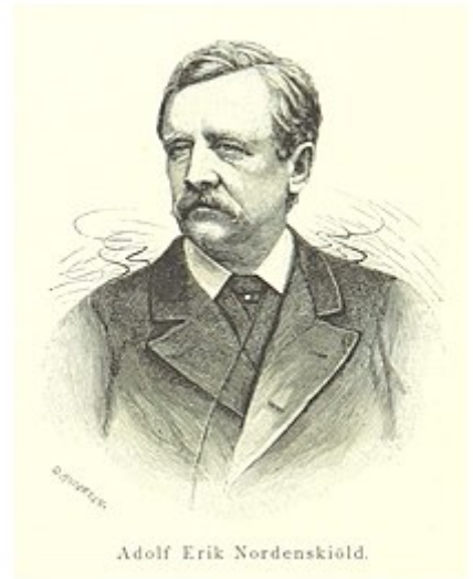
Adolf Erik Nordenskiöld