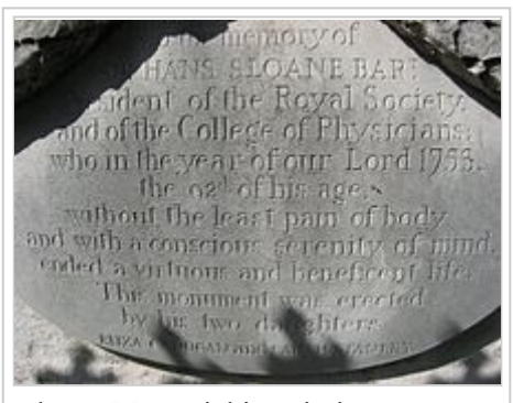
Sloane Memorial inscription